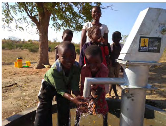
Water is life! Thank you for making this community joyful!