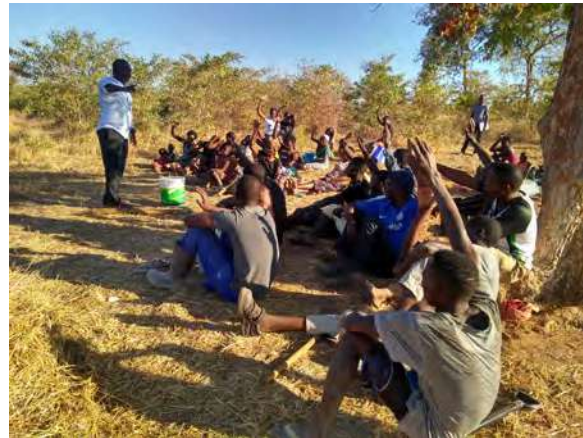
The Living Water staff lead a sanitation and hygiene training.

The community members were also encouraged to use latrines. They learned to store their water in air-tight containers separate from areas where they bathed, kept animals, or disposed of trash. The community members all left the lessons feeling well-prepared to begin practicing safe habits in their own daily lives. This would not have been possible without the safe water well.