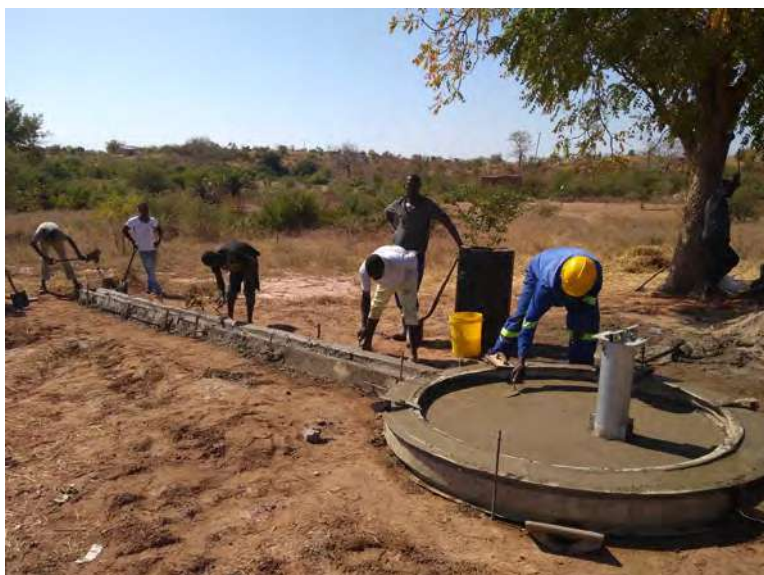
Once the borehole is cased, some community members help the staff lay cement for the well platform, which is designed to wick away water.