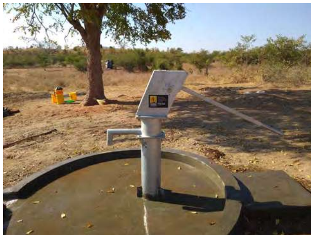
The well is complete!