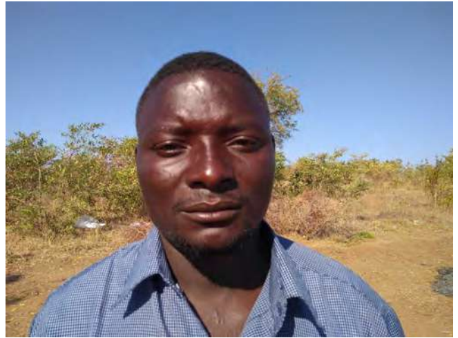
This man serves as the community water caretaker.

The Living Water staff wanted to help the community members learn how to manage their safe water sustainably. They therefore guided the community's nomination of a water caretaker. The caretaker would oversee the use and care of the pump and also collect a small fee per household for water usage in order to save a fund for any future repair costs. The community members were proud to take responsibility of managing their safe water well. The legacy of community-driven solutions will initiate a new season of health, dignity, and hope in Siamalola Village.