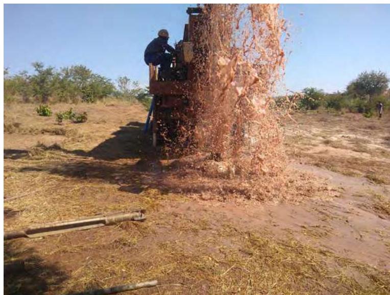
Water! The drilling staff have reached an aquifer and flush out the well.

The Living Water Zambia staff soon returned to begin work. They drilled until they reached an aquifer 40 meters deep. The next step was to case the borehole with PVC and a gravel pack. Then, the staff flushed the borehole to remove sedimentary rock debris, treated the water and tested its safe quality, and then installed the pump mechanism. Finally, they poured a concrete base designed to wick away water in order to prevent mosquitoes from nesting near the well. As the community members pumped water for the first time, they were filled with joy. Safe water would change everything!