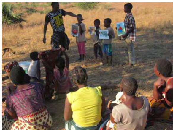
Community members learn about germ spread through the use of visual aids.