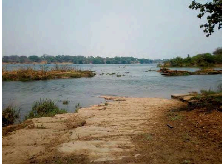
Although scenic, this river was unsafe for the community members to drink from

The water crisis made physical pain and constant fear a norm in the community. The residents longed to break this pattern.